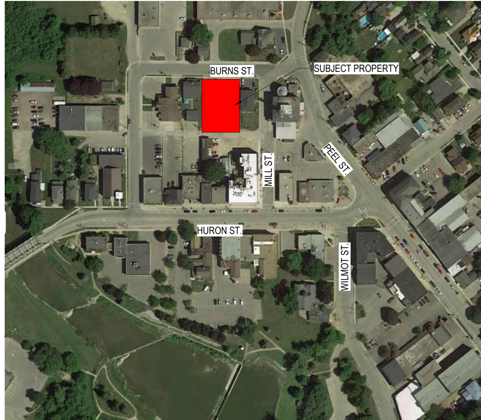
KEY PLAN Burns 2 1:2000 A1.1

SURVEY INFORMATION TAKEN FROM SURVEYORS' REAL PROPERTY REPORT WITH TOPOGRAPHIC INFORMATION LOTS 2 & 3 SOUTH OF BURNS STREET SMITH'S PLAN OF NEW HAMBURG TOWNSHIP OF WILMOT REGIONAL MUNICIPALITY OF WATERLOO PREPARED BY VAN HARTEN SURVEYING INC., DATED MAY 2, 2023.