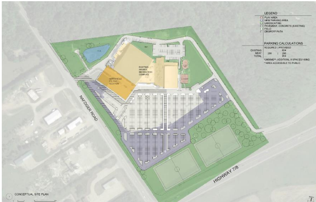
Concept Design Developed by Monteith Brown Planning Consultants Ltd.