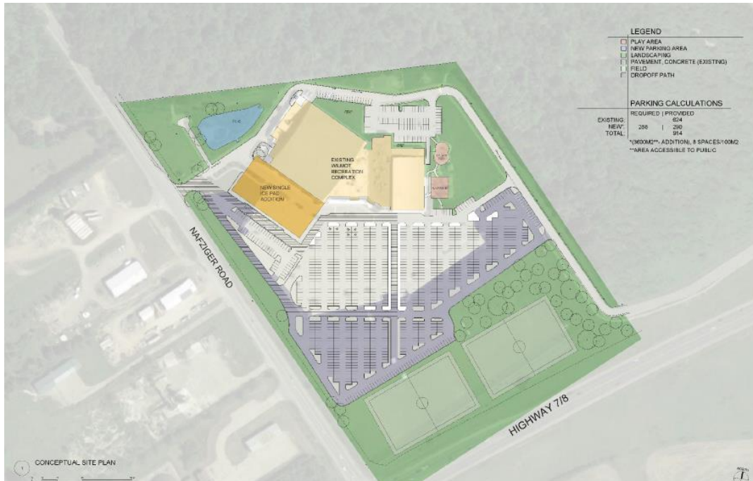
Concept Design Developed by Monteith Brown Planning Consultants Ltd.