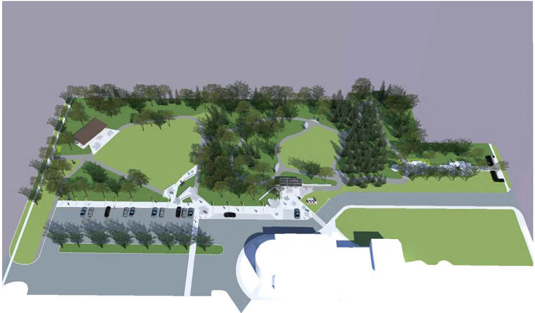
CONCEPT B DROP-