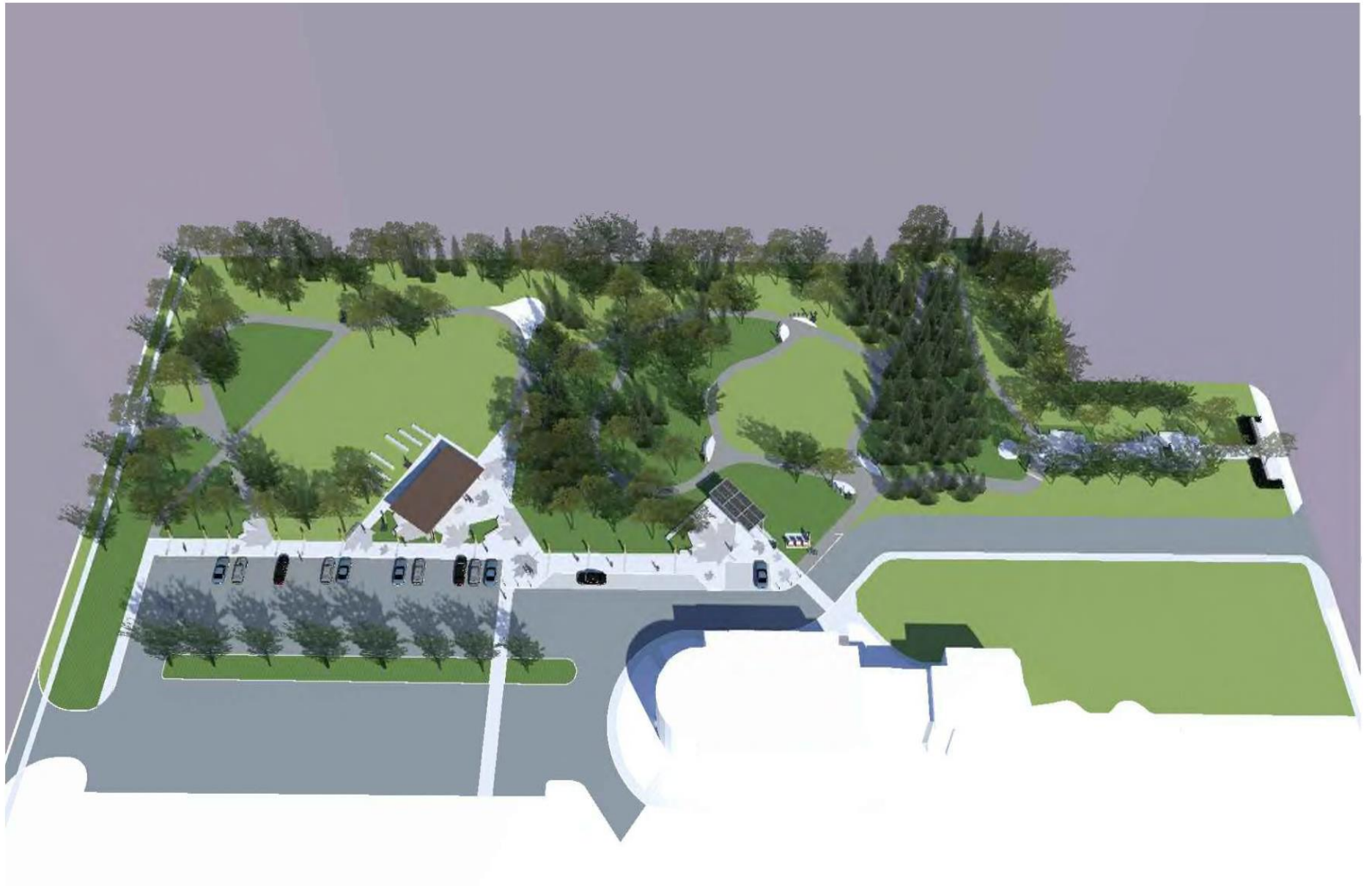
CONCEPT A OVERALL