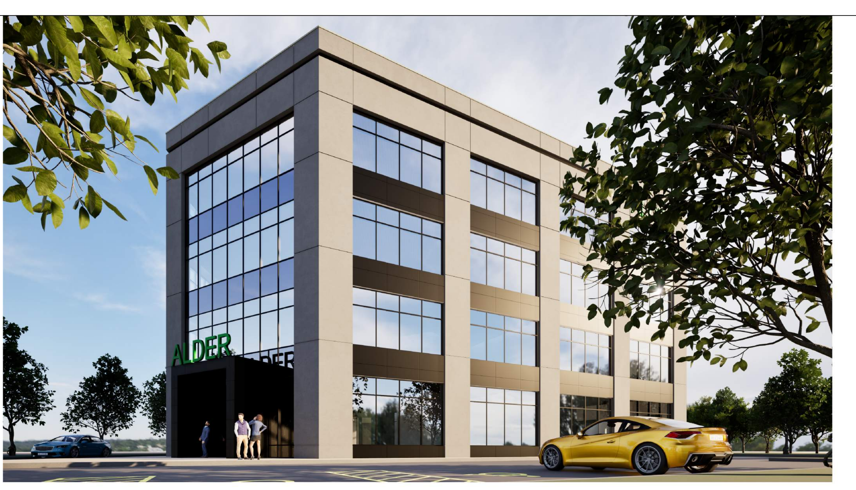
VIEW FROM THE EAST FACADE