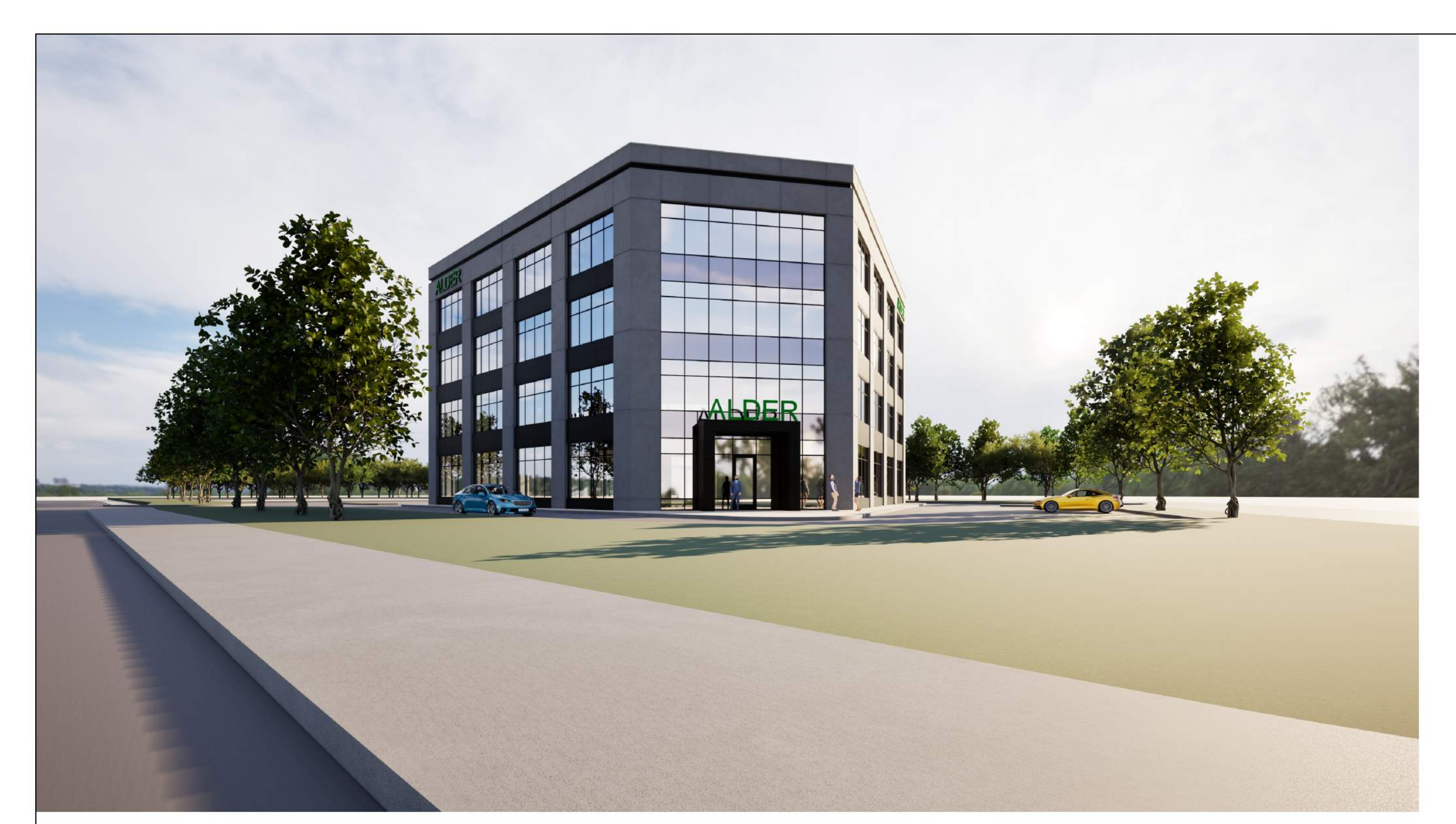
VIEW FROM THE CORNER OF SNYDER'S ROAD AND SANDHILLS ROAD