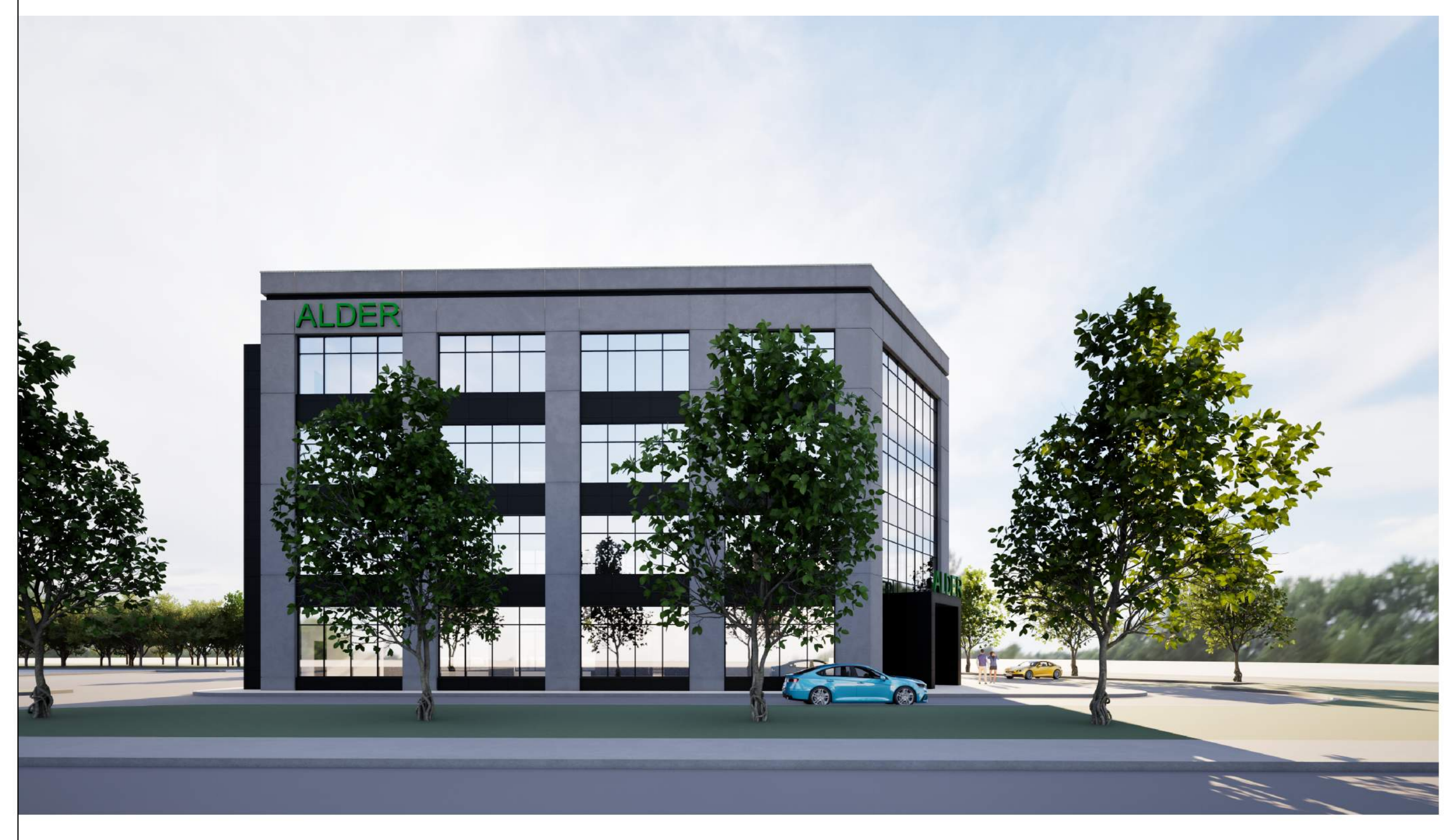
VIEW FROM SNYDER'S ROAD